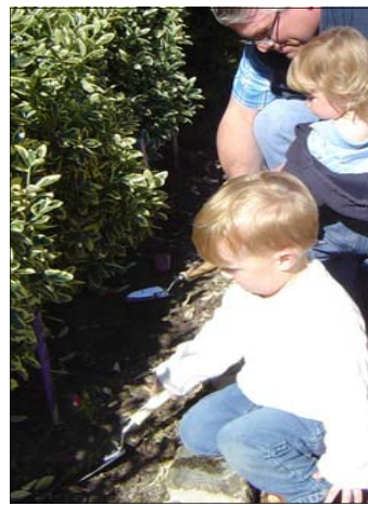
Cathedral Baptism families plant flowers that the parish family can help grow!

An email or letter will be sent with full instructions when the registration form in this brochure is received.