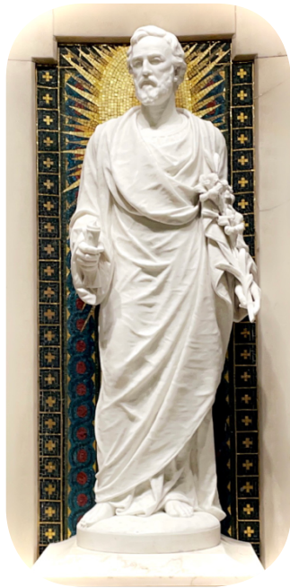
THE CATHEDRAL'S ST. JOSEPH STATUE