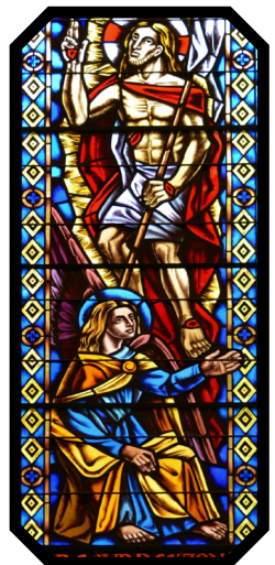
Resurrection window (Chigot, 1956)