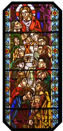
Eucharist window (Chigot, 1956)