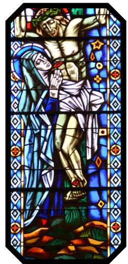
Crucifixion window (Chigot, 1956)